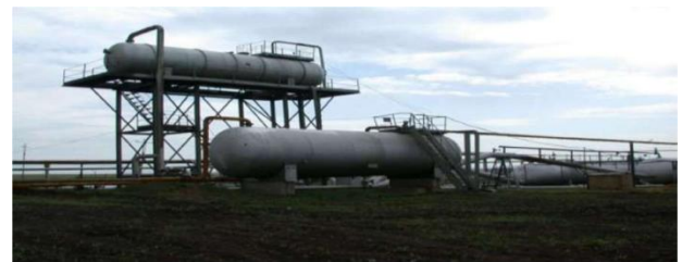
Fig. 1: Pressure vessel

are functions of diameter of the elements under consideration, the shape of the pressure vessel as well as the applied pressure.