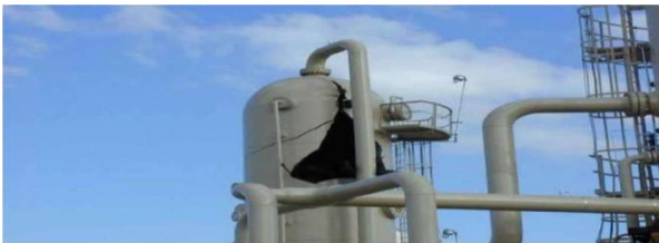
Fig. 2 Failure of pressure vessel during hydro Test

In order to meet a safe design, a designer must be familiar with the above mentioned failure and its causes. There have a few main factors to design safe pressure vessel. This study is focusing on analyzing the safety parameters for allowable working pressure. Allowable working pressures are calculated by using PV ELITE software which compile with the ASME section VIII, rules for construction pressure vessels. The objectives of the study is to design pressure vessel according to input data and analyze the safety parameters of each component for its allowable working pressure using; PV ELITE software.