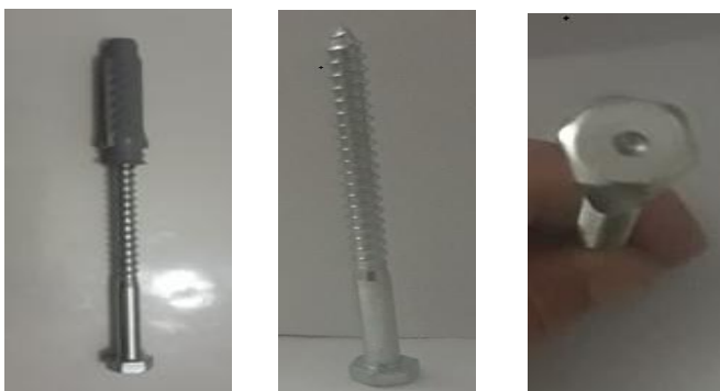
Figure 3: The center of the point

After the final definition of the local geodetic support grid points in the city of Gramsh that were determined during the field reconnaissance phase according to the GNSS point design criteria, we started with the grid point fixation phase. The fixing of the network points was mainly carried out along the sidewalks and in positions that are not affected by the developments, according to the urban plan of the Gramsh Municipality. The engineers of Gramsh Municipality, who knew the area in detail, also offered a great help. The fixation of the points was carried out far from the development areas with a distance of 20 - 100 m. Fixing of the points is done with concrete matalic screws (center/mark of the point) with a length of 150 mm and a width of 10 mm.